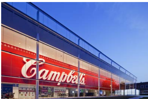
Campbell Employee Center, Camden, NJ

carefully done restoration and the colors have given the Ballroom new life and elegance.” KlingStubbins has now received four awards for its meticulous research and design of the Academy of Music Ballroom. The restoration of the National Historic Landmark was most recently recognized with a Citation of Merit from AIA Pennsylvania, as well as an Historic Interior Award from Preservation Pennsylvania and a Grand Jury Award from the Preservation Alliance for Greater Philadelphia. Contract Magazine featured the project in its September 2010 issue.